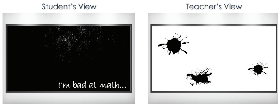
Figure 2 – A Student and Teacher’s Different Viewpoints

Therefore, it is important that students express even little parts of problem-solving that confuse them as they work through a mathematical exercise. It would be a welcome change if students’ problem-solving episodes along with specific difficulties that they faced are captured in an automated fashion, compiled, and presented to instructors through an application.